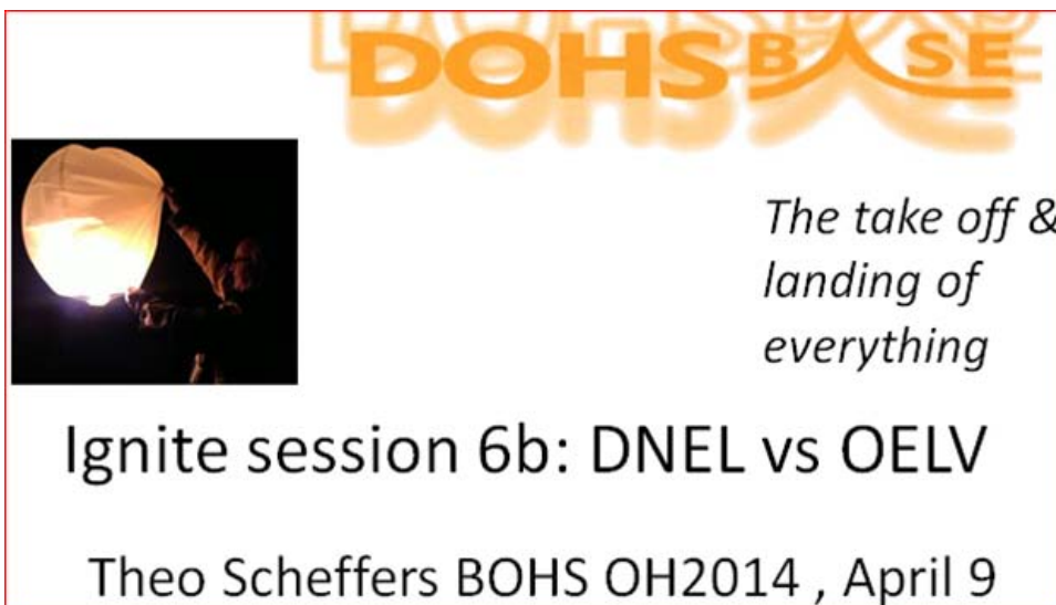
Figure 1 First sheet of the ignite on DNEL versus OELV

Industry have derived since 2008 several thousand DNELs/DMELs for the workplace air and even for substances that already have working conditions legislation-based occupational workplace air exposure limit values (OELV) like the WEL in the UK, the MAK in Germany and the European IOLVs etc.