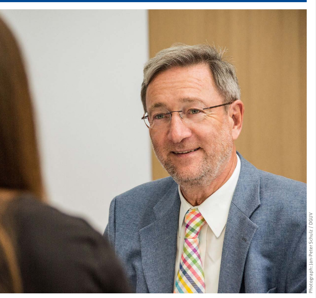
The benefits to companies and administrations of a good prevention culture include less time off work and fewer accidents, improved quality, and being more attractive as an employer.

health every day, then you won't be successful - whether you're in Germany or in Pakistan. That's why the road to a prevention culture means that everyone has to 'come with us'. But the komm mit mensch campaign in Germany goes beyond Vision Zero and companies alone. It's about parents who wear a bike helmet; a father who explains to his son that failure is also an opportunity; and it's about mutual appreciation. It's about being allowed to make mistakes and learn from them - whether on the job, doing voluntary work, at school or in our private lives. It's about prevention as a value, and values don't stop at the factory gates or when we finish work for the day.