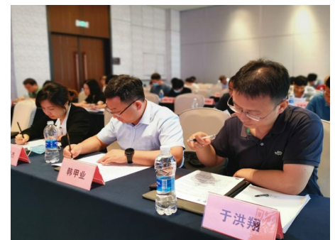
The project involved workshops on data collection. The image above is from a workshop in 2022 for 52 safety managers from 26 companies.